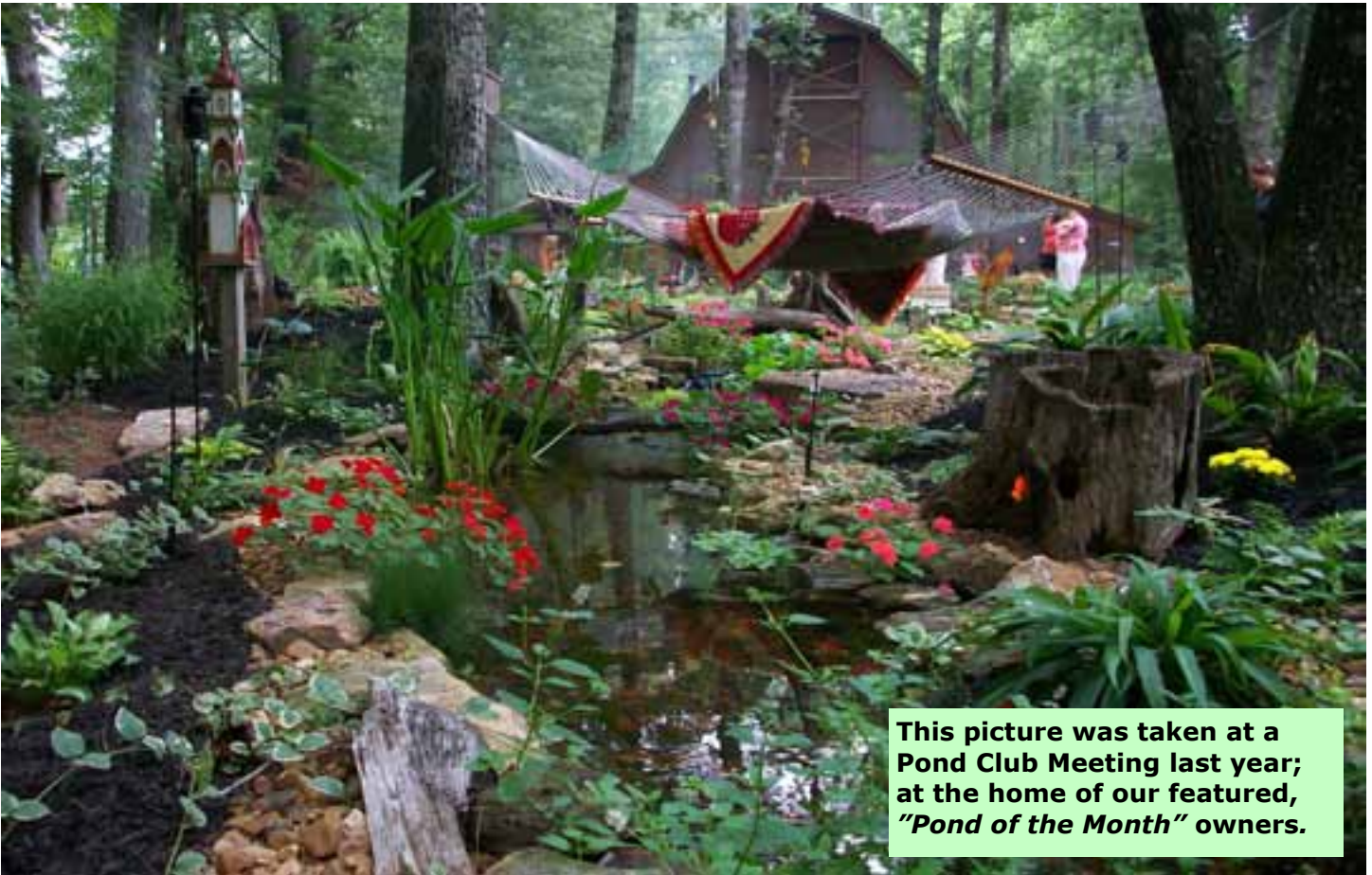
This picture was taken at a Pond Club Meeting last year; at the home of our featured, "Pond of the Month" owners.